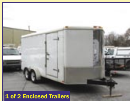
1 of 2 Enclosed Trailers