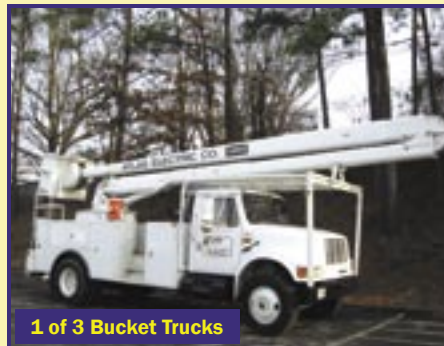
1 of 3 Bucket Trucks