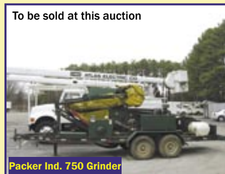
To be sold at this auction