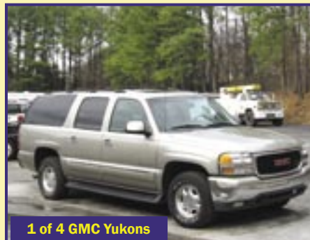
1 of 4 GMC Yukons